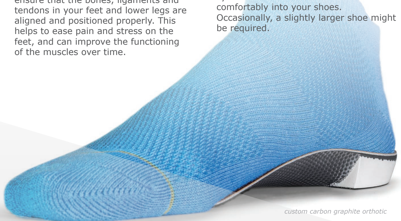
custom carbon graphite orthotic

Custom orthotics work on your feet much like glasses work on your eyes they reduce stress and strain on your body by bringing your feet back into proper alignment. The composite body of the custom orthotic helps to re-align the foot by redirecting and reducing certain motion that takes place during the gait cycle. Most often custom orthotics will fit comfortably into your shoes. Occasionally, a slightly larger shoe might be required.